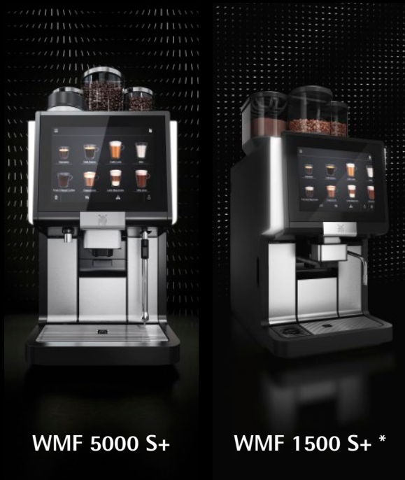
WMF 5000 S+