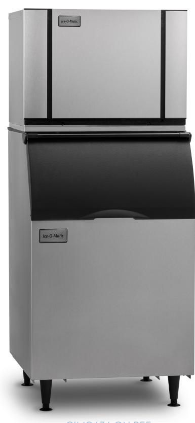
CIMO636 ON B55