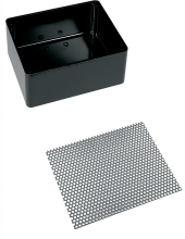
DRIP TRAY KIT (2.5"HT- HW2)